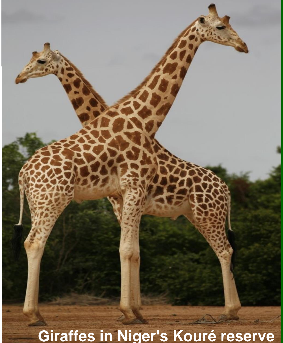
Giraffes in Niger's Kouré reserve